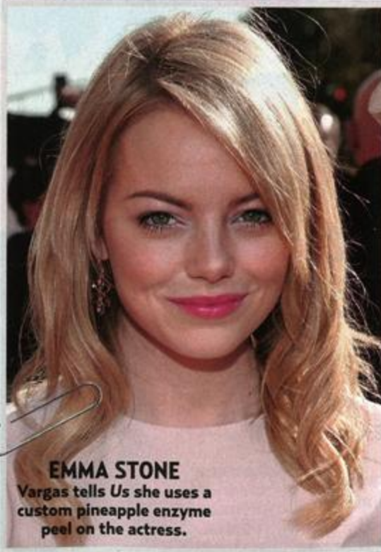
EMMA STONE Vargas tells Us she uses a custom pineapple enzyme peel on the actress.

▲ "A gentle exfoliating cleanser improves texture without irritation. This foam contains rice bran and geranium." ($60, chantecaille.com )