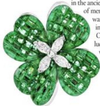
VAN CLEEF & ARPELS EMERALD EARRINGS (PRICE ON REQUEST), VANCLEEFARPELS.COM