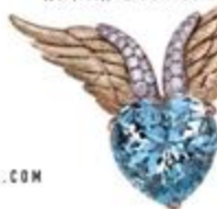
AQUAMARINE A sailor's good luck talisman. Works for even mere mortals traveling over water. VERDURA BROOCH ($67,000), VERDURA.COM.