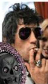
SKULL Herodotus, Plato, and Tibetan monks claimed its powers long before Keith Richards. AMEDEO RING ($6,300), MYAMEDEO.COM.