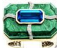
MALACHITE Healing properties are ascribed to all green stones; this is a current favorite. KARA ROSS BRACELET ($33,395), NEIMANMARCUS.COM.

A CHEAT SHEET ON THE POWERS OF GEMS, MEANT TO INFLUENCE FUTURE JEWELRY PURCHASES.