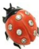
VAN CLEEF & ARPELS COLLECTION ARCHIVAL LADYBUG BROOCH