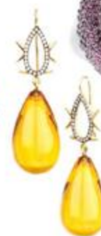
AMBER Thought to give off the force of life, protect children, and heal joint problems. SYLVA & CIE EARRINGS ($6,000), MITCHELLS, 203-227-5165.