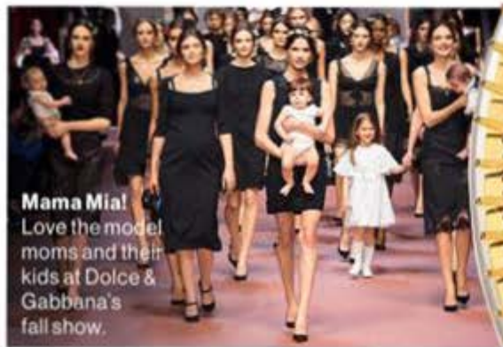
Mama Mia! Love the model moms and their kids at Dolce & Gabbana's fall show.