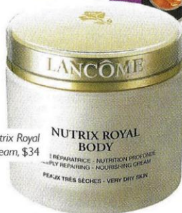
Lancôme Nutrix Royal Body Cream, $34