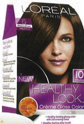
L'Oréal Paris Healthy Look Crème Gloss Hair Color, $10