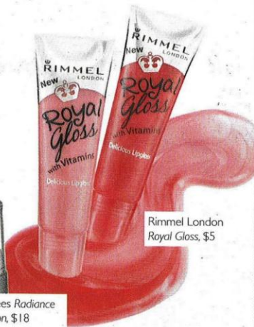
Rimmel London Royal Gloss, $5

Want to feel like a queen bee? Now you can enjoy the regal treatment. Royal jelly, the blend of nectar, pollen and flowers that worker bees feed exclusively to their future queen, can also enhance your skin's radiance and health. This much buzzed-about ingredient is now leaving the hive and entering the beauty aisle. You can find this special concoction in many Burt's Bees products, including the Radiance Day Lotion SPF 15 ($18, burtsbees.com). Available in ten gorgeous shades, Rimmel London Royal Gloss ($5, drugstores) is enriched with vitamins A, C and E, as well as royal jelly. This bee byproduct boosts shine and silkiness in L'Oréal Paris Healthy Look Crème Gloss Hair Color ($10, drugstores), an ammonia-free color and conditioning system. Keep skin supple and soft with the jelly-enriched Lancôme Nutrix Royal Body Cream ($34, lancome.com), which helps repair dry skin.