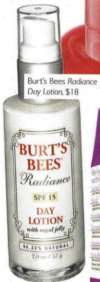
Burt's Bees Radiance Day Lotion, $18